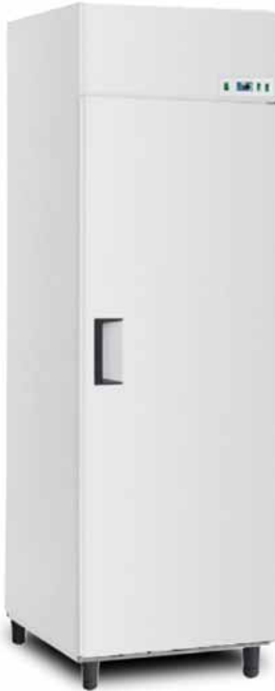
I-Eve P AG*